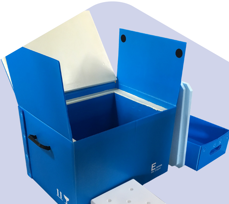
Example: E series, summer ambient data Pack-out Configuration: RBC20M48-M5